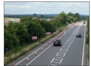
Narrow lanes on the Wendover Bypass at the Wellwick Concrete site

A local concrete "batching plant" is being installed next to the bypass, and the width of the road has been narrowed to form a slip road to allow the lorries transporting the material needed to build the Small Dean and Wendover Dean viaducts.