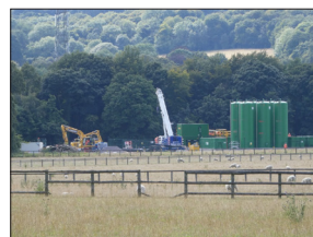
Bentonite tanks at the Small Dean Viaduct piling site

If you want to apply and don't know what to do, then get in touch and we'll assist however we can. Please email us at enquiries@whs2.org .