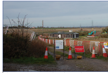
The site access road at the Cricket Ground.

to Bacombe Lane. Work will start on building the temporary Ellesborough Road diversion, prior to the demolition of the cottages which is now expected in April. Work has also started at the Cricket Ground, with a site access road being built as we go to press.