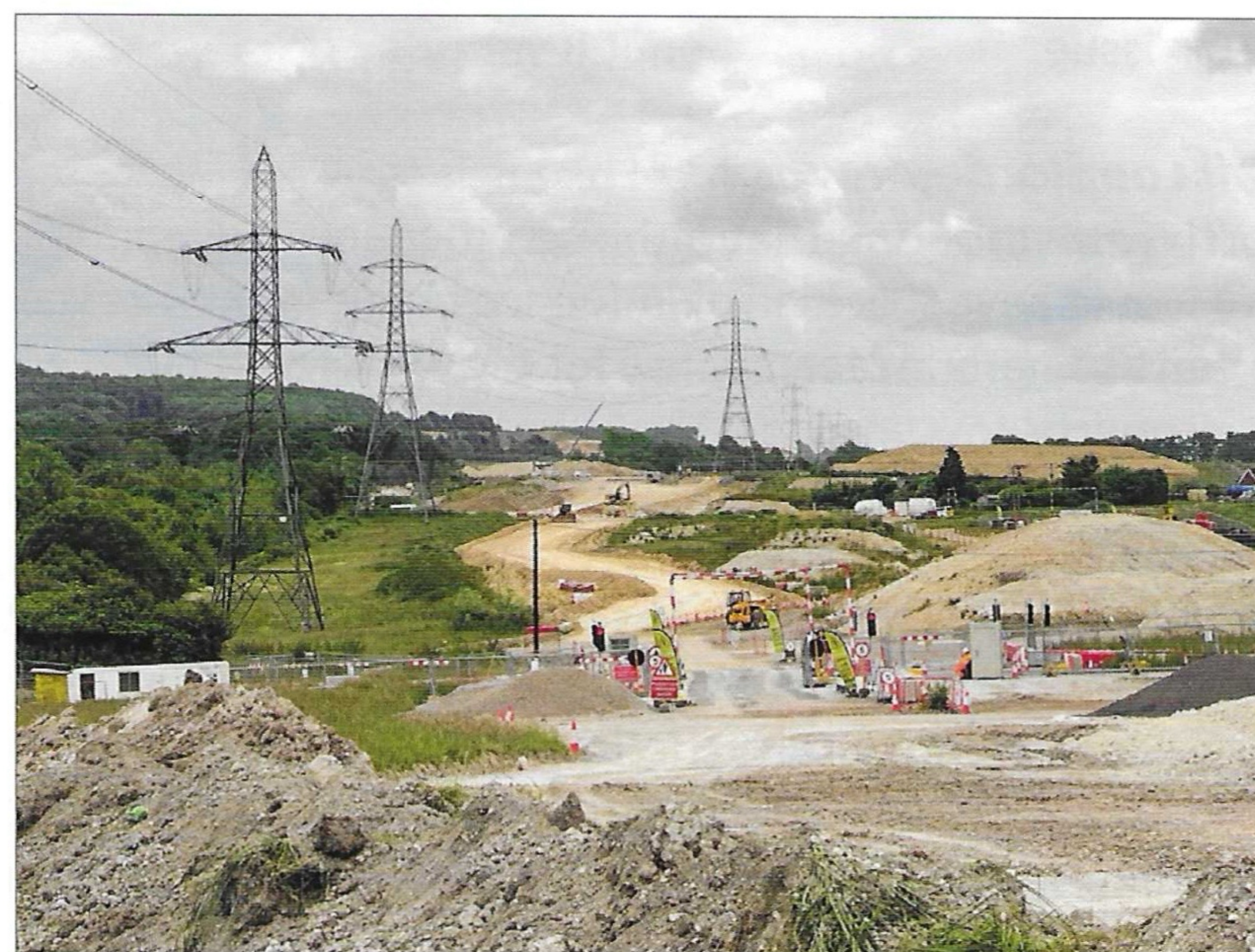
Haul road from Small Dean to Bacombe Lane.

Meanwhile HS2 and its contractors have withdrawn from public events until the election is over. We are still able to talk to Bucks Council and have been discussing various road traffic issues as well as what will happen to the land that HS2 will dispose of when it's finished. We plan to give an update on all the above at the Public Meeting in the Wendover Memorial Hall on Friday 28 June at 19:00.