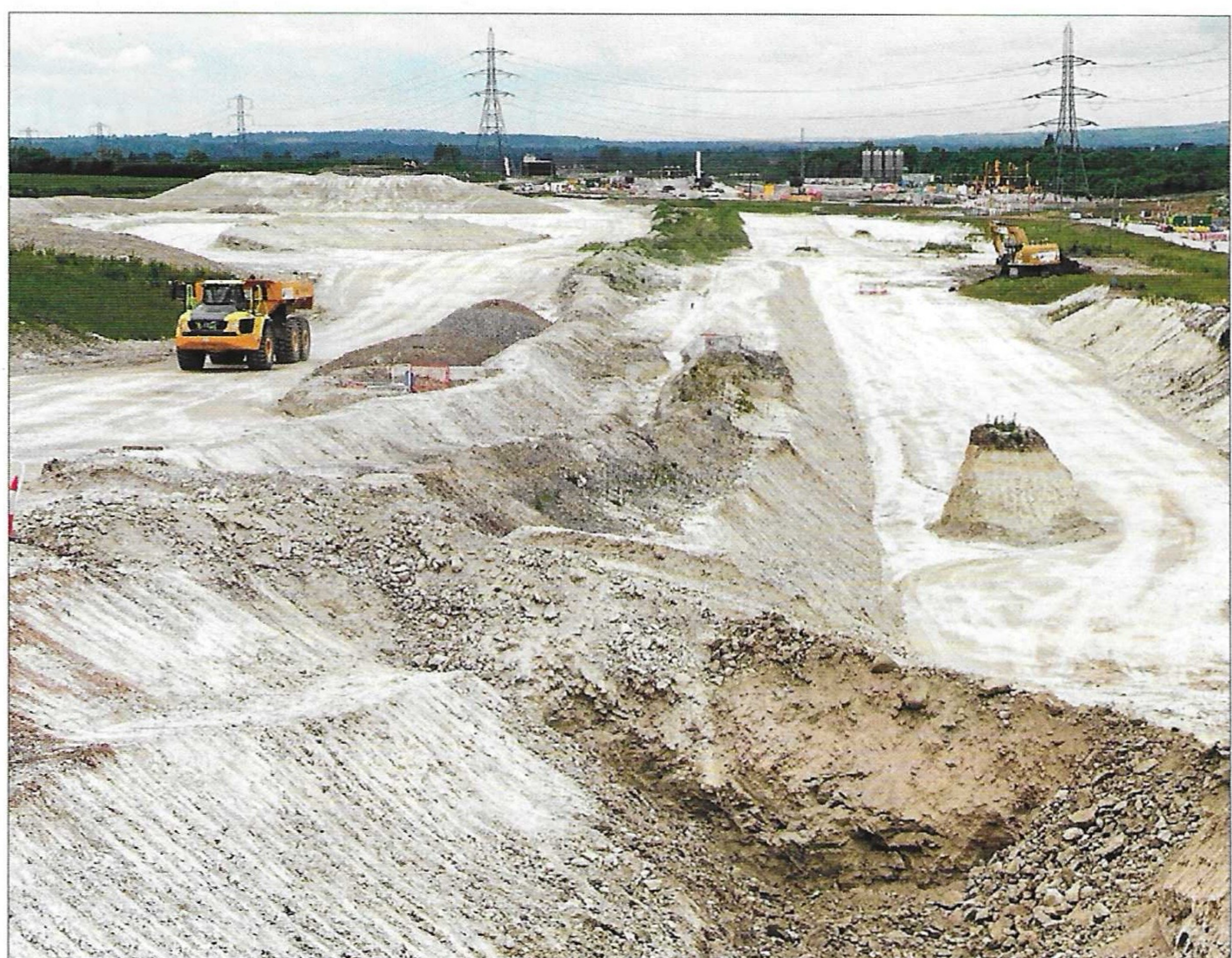
Haul road beside the bypass